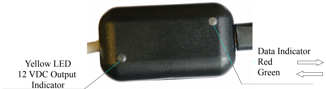
Fig. 3. Closed lid converter