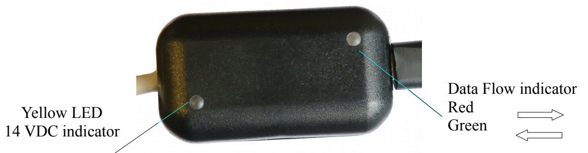
Fig. 3. Closed lid converter